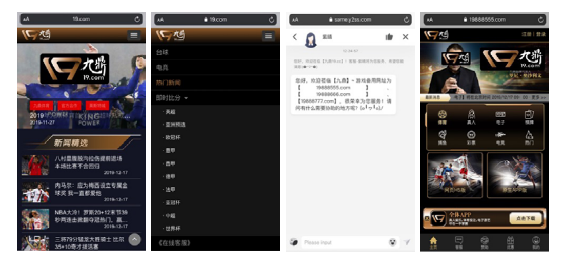
Figure 1 - From left to right, 19.com's homepage, customer service link (bottom), customer service page, and mirror site.

Those three websites are all branded with the 19.com logo, all offer full mobile account betting services, and are only available in Chinese language. This is classic mirror website positioning aimed at a non-UK audience, and is far from the only case amongst sponsors in British sport.