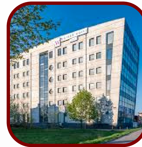
Hotel Weiser Al. Kromera 16 Wrocław