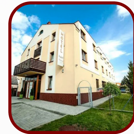
Hotel Sleep ul. Kominiarska 33 Wrocław