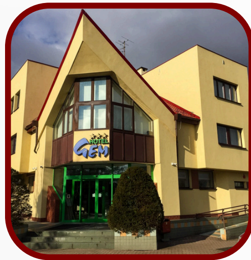
Hotel GEM ul. Mianowskiego 2b Wrocław

Here are some examples of hotels with good access to the baseball field: