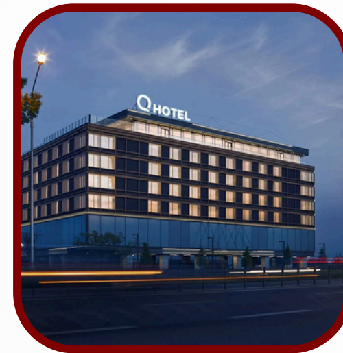
Q Hotel Plus Wrocław Bielany ul. Szwedzka 7 Bielany Wrocławskie